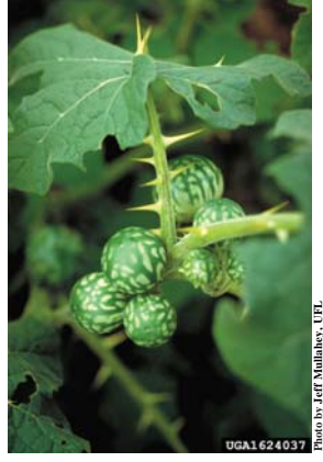
Tropical soda apple Solanum viarum