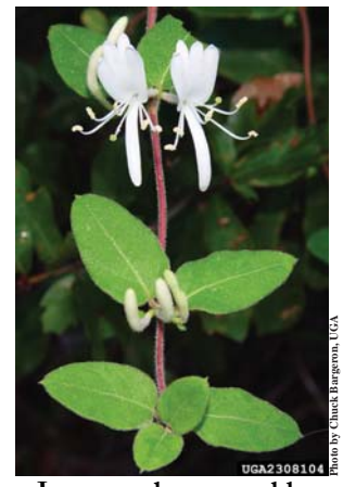
Japanese honeysuckle Lonicera japonica