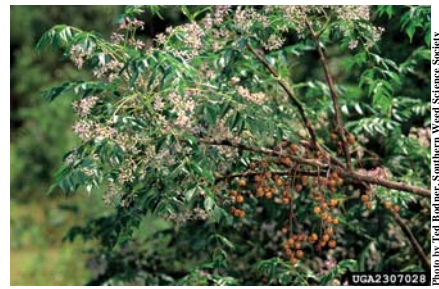
Chinaberrytree - Melia azedarach