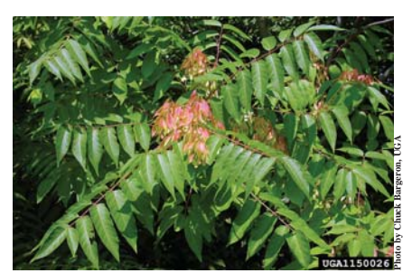
Tree of heaven - Ailanthus altissima