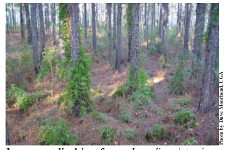
Japanese climbing fern - Lygodium japonicum