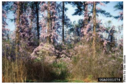
Chinese wisteria - Wisteria sinensis