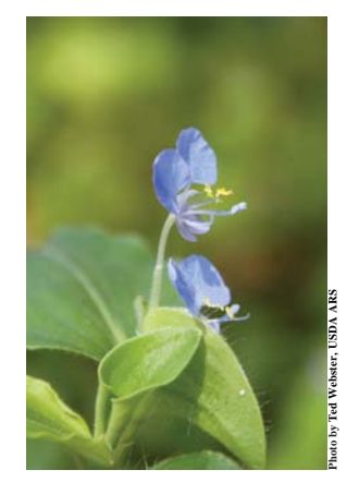
Tropical spiderwort Commelina benghalensis