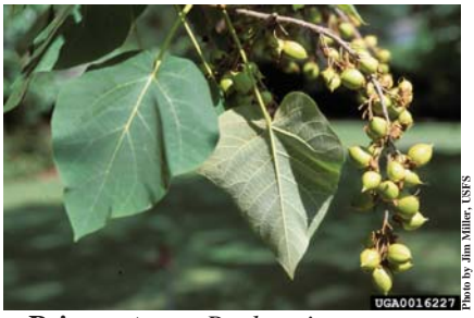
Princesstree - Paulownia tomentosa