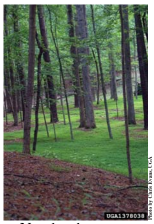
Nepalese browntop Microstegium vimineum