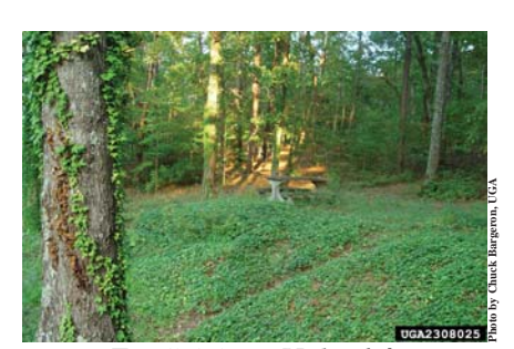
English ivy - Hedera helix