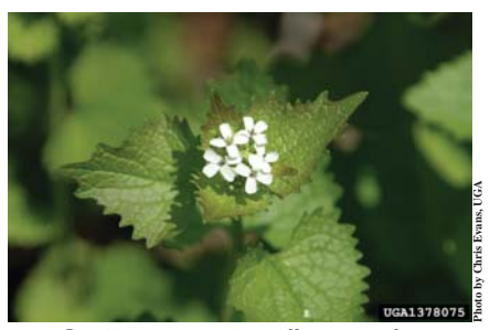
Garlic mustard - Alliaria petiolata