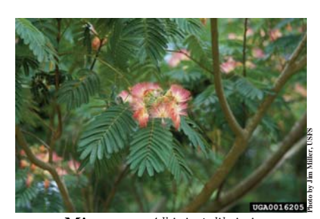
Mimosa - Albizia julibrissin