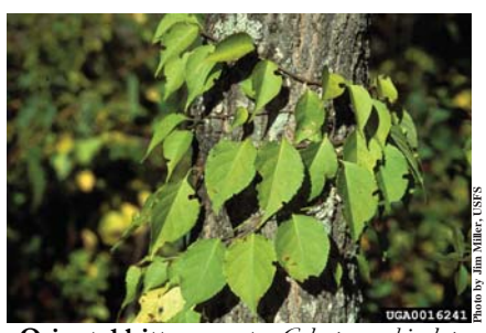
Oriental bittersweet - Celastrus orbiculatus