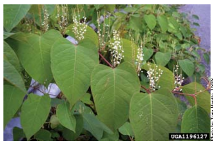
Japanese knotweed - Polygonum cuspidatum