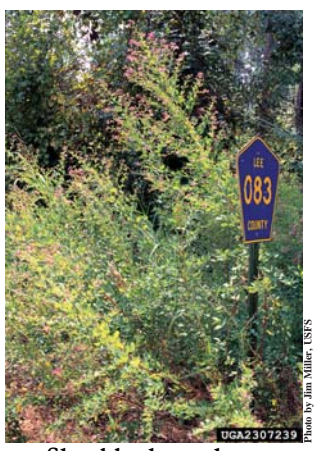
Shrubby lespedeza Lespedeza bicolor