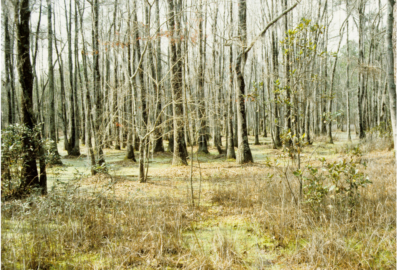
Habitat appearance.