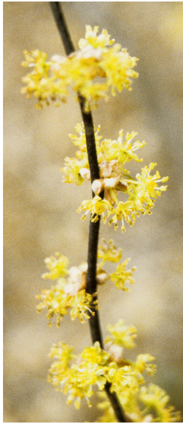
Male and female flowers on different plants in Early Spring.