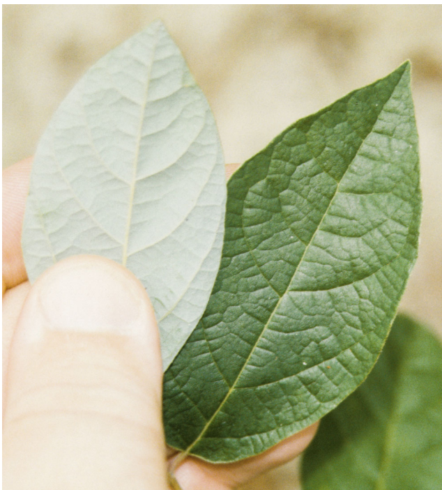
Leaves front and back. (late Summer)