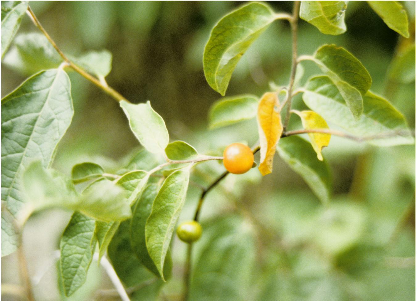
Twigs, leaves, and fruit. (late Summer)