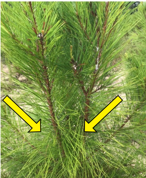
Figure 5. Stem forking due to NPTM damage.

Over the last 30-40 years, southern pine plantation management has become more complex with added investments like mechanical and/or chemical site preparation, herbicide treatments, fertilizers, and genetically improved seedlings to increase growth and yield of timber. 1,2,8 Heavily NPTM-infested pine plantations can therefore potentially incur significant economic damage by reducing growth and compromising the form of loblolly pines in high-investment plantation settings.