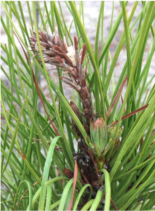
Figure 4. Brown, dead pine tip.