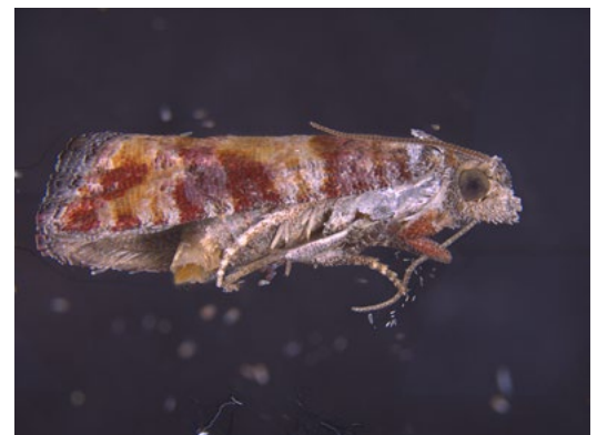
Figure 1. Nantucket pine tip moth adult.

The native Nantucket pine tip moth (NPTM), is a regeneration pest with a range throughout much of the eastern United States (Figure 1). NPTM causes reduced tree growth and stem form defects in loblolly pine ( Pinus taeda L.), the most commercially important pine species in the southeastern US. 1 NPTM is the only tip moth species in the eastern United States that causes economic damage to commercial pine trees. 2 In the southeast, preferred hosts of NPTM are loblolly, shortleaf ( Pinus echinata Mill.), and Virginia ( Pinus virginiana Mill.) pines. 3 However, most attention is focused on NPTM damage to loblolly pine, due to its financial importance. Plants grown in monoculture (single species plantings) can be especially susceptible to insect pests, because abundant host resources are in proximity. In addition, with monocultures in general, there is a decreased diversity of natural enemies. 4 Loblolly pine stands are typically harvested every 20 – 30+ years, depending on the desired product. Unlike agricultural crops, growers do not have an opportunity to try again the next year if trees are seriously damaged or have the benefit of year-to-year knowledge of the financial benefit of management tactics. These forestry-specific limitations make it difficult to determine when NPTM management is a financially desirable choice.