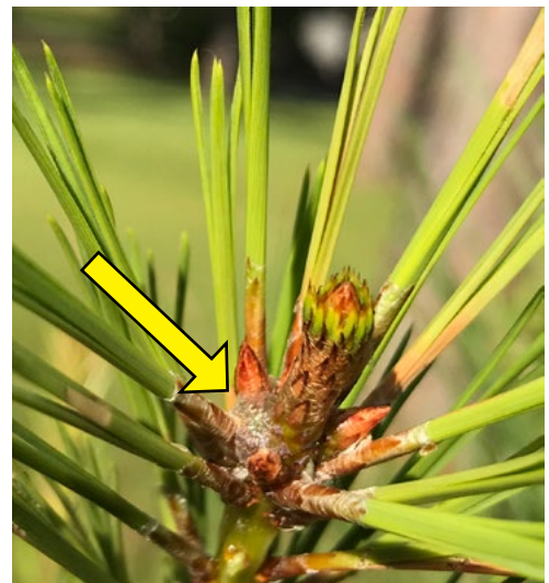
Figure 3. Pine tip moth tenting.

Depending on the region, NPTM can have anywhere from two to five generations annually. 3 Temperature influences the number of generations NPTM has in a year. 7 Numerous generations per year means that there are numerous times for NPTM to negatively affect the growth of new pine tips.