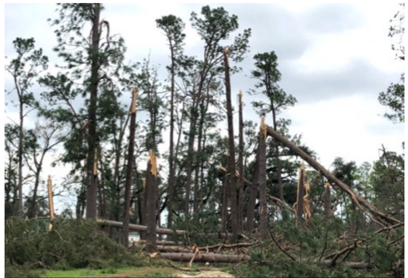
Fig. 1: Windthrow of a pine stand from Hurricane Michael.

Catastrophic windstorms and southern pine beetle ( Dendroctonus frontalis Zimmerman ) outbreaks are considered primary sources of natural disturbances in the southeastern U.S. 1 Important windstorms include hurricanes, tornadoes, and derechos (straight-line winds with downbursts). 2 Tornadoes are most likely to occur in February and March, with a second peak of activity in November – December in the South. 2 Derechos are most common in September – April, although they can occur during any time of the year in southern forests. 3 Canopy tree mortality due to windstorms can occur on the scale of a few to millions of trees in a short time-span. The severity of tree mortality is based on storm size and intensity, stand characteristics (e.g., soil type, tree species, stand age, tree heights, and thinned or unthinned), and conditions prior to the event. Tree mortality occurs primarily through the snapping of boles, uprooting, and branch and canopy damage. Since most storms are associated with heavy rainfall, flooding and soil erosion can further damage tree roots and younger trees.