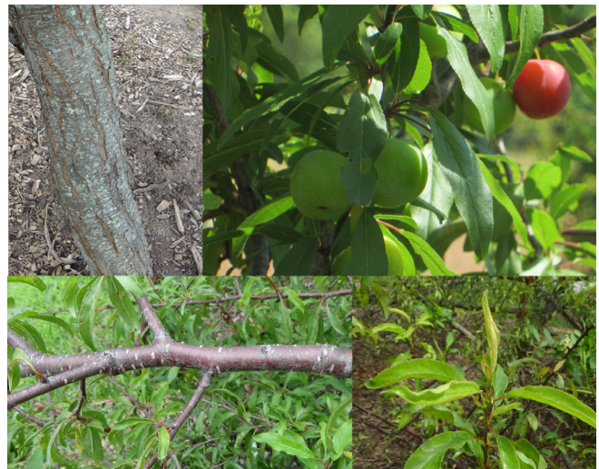
Fig. 5: Chickasaw plum (clockwise from top left) bark on trunk, unripe and ripe fruit, leaves, and bark on branches. Images by Heather Kolich.