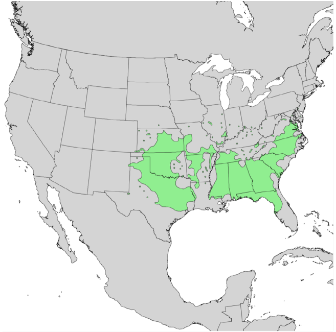
Fig. 4: Chickasaw plum native range map. Data: Little (1971). Map: USGS

From February to April, Chickasaw plums produce abundant, fragrant flowers (Fig. 5). The small, white, 5-petaled flowers are a 1/3 in (0.8 cm) across and have orange anthers. They occur in clusters on side twigs and tips of branches. Chickasaw plum leaves are shorter and narrower than American plum leaves. The narrow, pointed leaves are 1.5 - 3 in (3.8 - 7.6 cm) long and .25 - 4/5 in (0.16 - 0.3 cm) wide with a finely serrated leaf edge. The leaves are alternately arranged; have a shiny, dark green leaf surface that is lighter below; and angle upward along the midrib creating an elongated trough (Row & Geyer, 2010). The fruit is a round, 1/3 - 1/2 in (0.83 - 1.3 cm) yellow to red fleshy plum, ripening from June to August and containing one pit. Ripe plums have a whitish appearance (bloom) on the skin. Bark on younger trees is similar to American plum; however, in comparison, bark on mature Chickasaw plums is scaly and contains cracks and shallow furrows. Twigs are slender, zig-zag in appearance, and reddish brown with raised leaf scars, thorny branches, and small red buds.