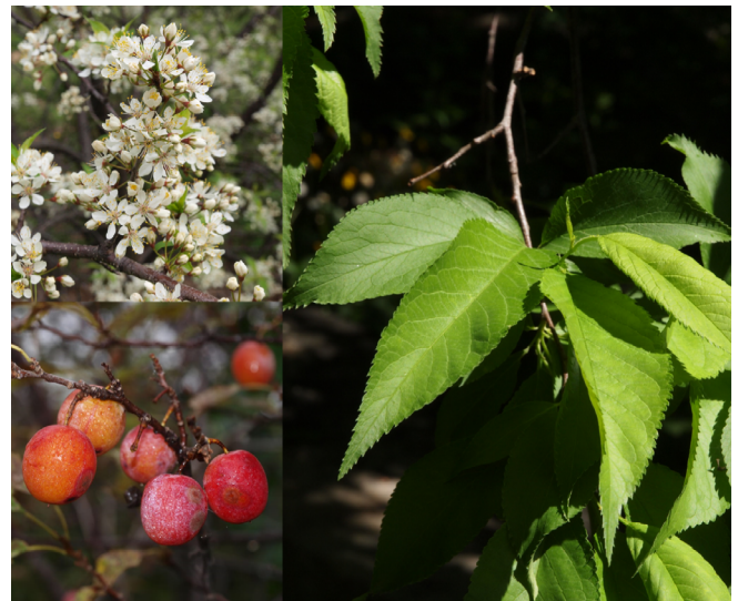
Fig. 3: American plum flowers (top left), ripe fruit (bottom left), and leaves (right).