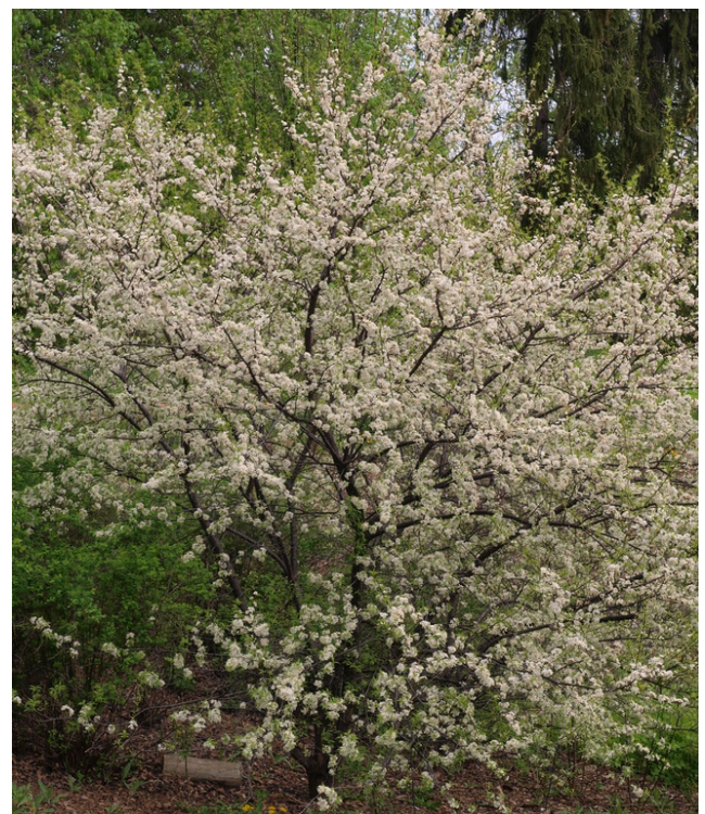
Figure 1: American plum in flower.

Wild plums are a nutritious food source for humans and other animals. One hundred grams (g) of wild plums contain approximately 90 calories, 10 g of sugars, 5 g of dietary fiber, < 1 g of protein and fat, 364 milligrams of potassium, and smaller quantities of several minerals and vitamins including calcium, magnesium, phosphorous, Vitamin C, and more (USDA ARS, 2019).